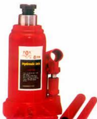
立式千斤頂 HYDRAULIC BOTTLE JACK