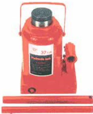
立式千斤頂(老式樣) HYDRAULIC BOTTLE JACK, OLD TYPE