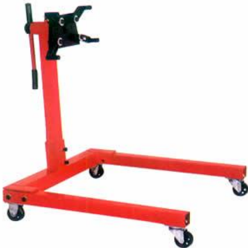
引擎支架 ENGINE STAND