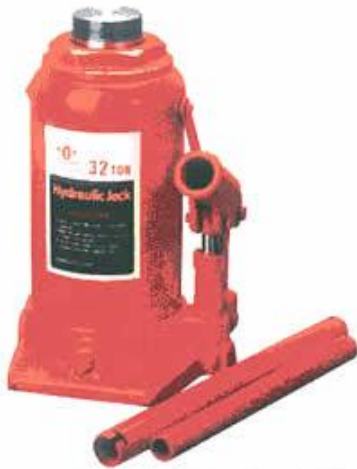
立式千斤頂(新式樣) HYDRAULIC BOTTLE JACK, NEW TYPE