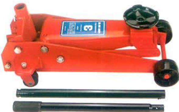
卧式千斤頂 FLOOR JACK