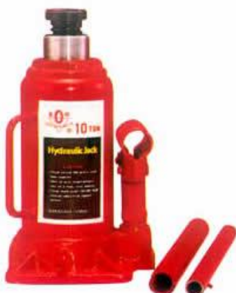
立式千斤頂 HYDRAULIC BOTTLE JACK