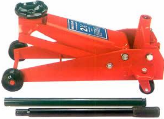
卧式千斤頂 FLOOR JACK