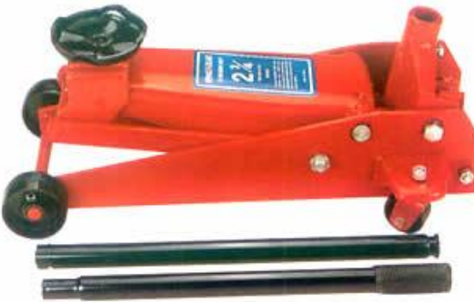
卧式千斤頂 FLOOR JACK