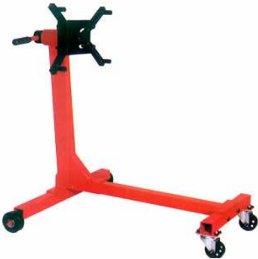
引擎支架 ENGINE STAND