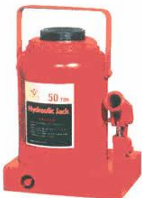
立式千斤頂 HYDRAULIC BOTTLE JACK