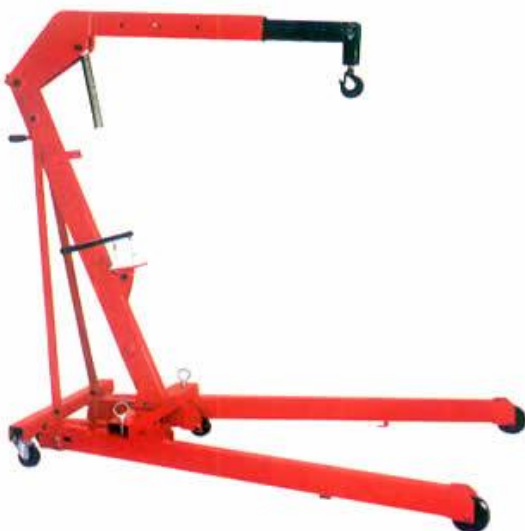
引擎吊機 ENGINE HOIST