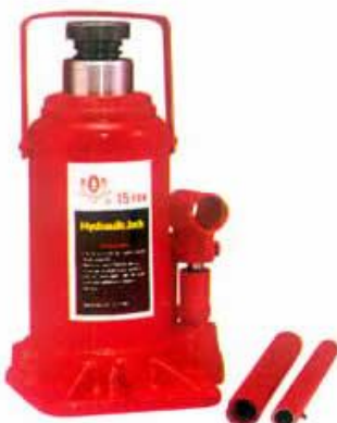
立式千斤頂 HYDRAULIC BOTTLE JACK