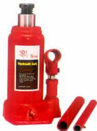
立式千斤頂 HYDRAULIC BOTTLE JACK