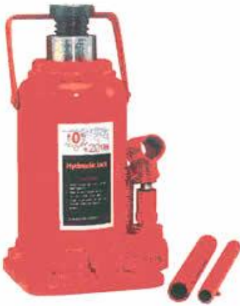
立式千斤頂 HYDRAULIC BOTTLE JACK